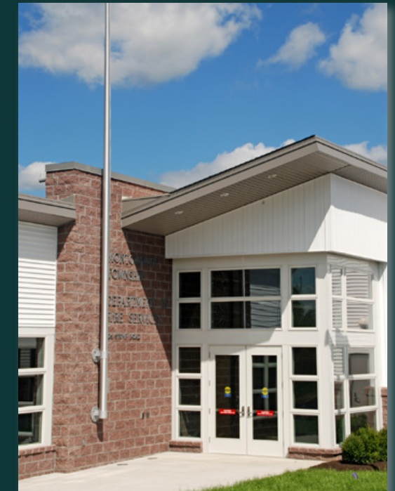
Below, Before Renovation and Expansion